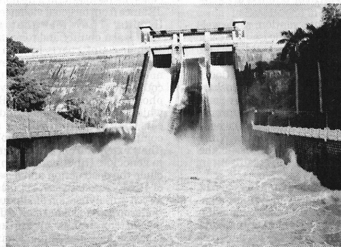
File photo of Parambikulam dam

The old shutter was 42 feet wide and 27 feet high. Raw materials for the new shutter could be purchased from the Salem steel plant or those in